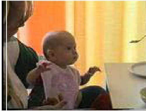
Picture from the Graz Hospital for Sick Children, Austria.

When a baby is born prematurely or suffers from a physical anomaly needing surgical intervention right away or is suffering from any other severe pediatric disorder, then things are all different. The most normal things are not working properly, and often eating and learning to eat become one of those essential developmental things that suddenly fail to develop normally. The doctors will tell you that the baby needs time, the speech therapist will talk about oral hypersensitivity, the neurologist will talk about decreased sensory coordination, the psychologist will talk about the possibility of the baby